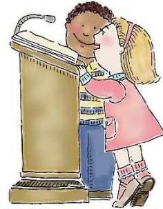
Children's Worship Service

The CHILDREN of FPC offer the service today! Rehearsal in the sanctuary beginning at 8:30 AM